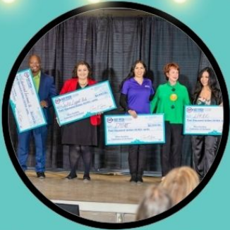
Pictured: Fast Pitch Class of 2023

Fast Pitch Nonprofit Participants have completed the Program since 2015!