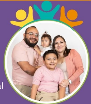
Pictured: October Families Coming Together event attendees

SVP’s 2Gen Nonprofit Collaboration provided three community events this year offering resources, programs, support, and fun for local families.