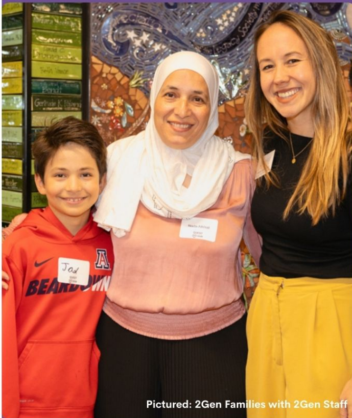
Pictured: 2Gen Families with 2Gen Staff