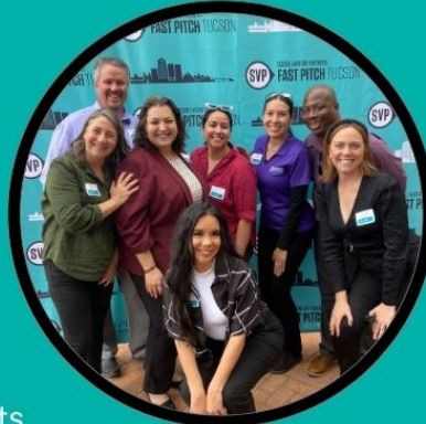
Pictured: Fast Pitch Class of 2023