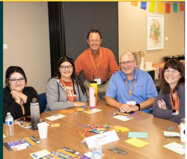
Pictured: 2Gen Staff with SVP Partners

The Connie Hillman Family Foundation will match contributions, for every $2 donated, $1 will be matched, with the potential to reach $3 million. Funding supports the 2Gen Nonprofit Collaboration and provides resources and programs for both children and the adults in their lives!