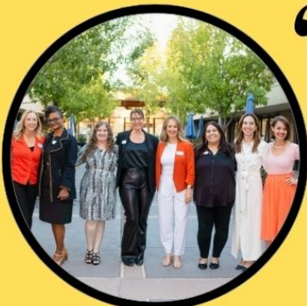
Pictured: SVP Tucson Staff

“ THANK YOU FROM THE SVP TUCSON STAFF TEAM! ALL THIS IS POSSIBLE BECAUSE OF YOUR PARTNERSHIP! ”